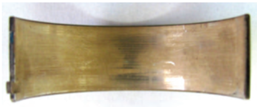
Fig. 3: King “next generation” bearing after one season racing.