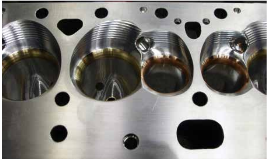
CNC machining can duplicate port profiles that take many hours to develop on a flow bench. It's also more accurate than casting or hand porting.

There are a couple of bottlenecks in a traditional pushrod V8 cylinder