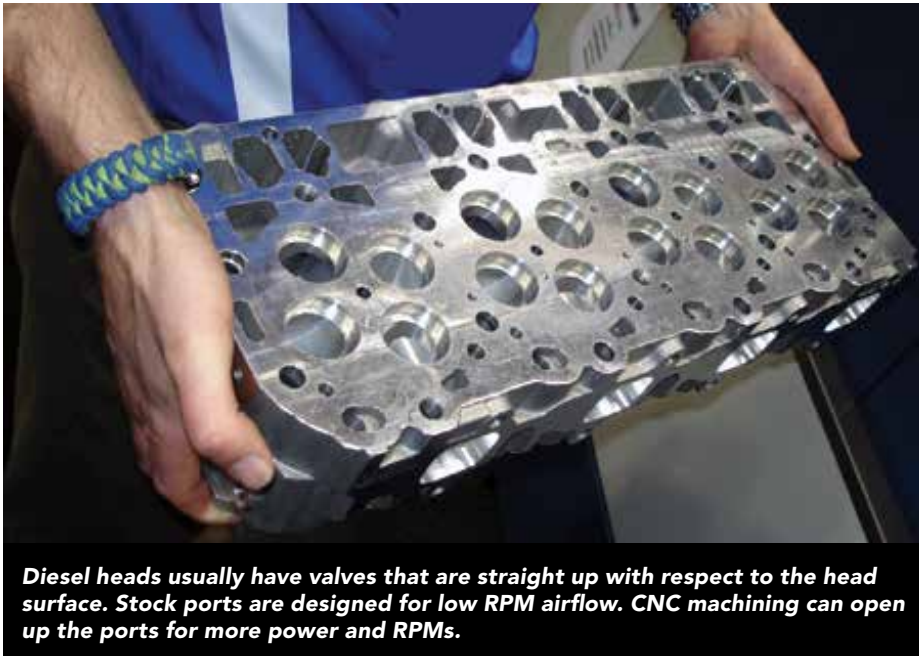
Diesel heads usually have valves that are straight up with respect to the head surface. Stock ports are designed for low RPM airflow. CNC machining can open up the ports for more power and RPMs.

mid-range torque. The heads need to be sized to the application.