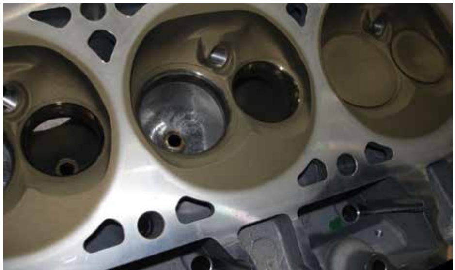
Heat reflective ceramic metallic coatings inside the combustion chamber can improve thermal efficiency by reducing heat transfer into the head.

head that hinder airflow. The intake ports usually make a sharp turn just above the intake valves. The "short side" of the port can cause the air/fuel mixture to separate as it tries to round the tight curve just above the valves. Head porters usually reshape this area to make for a smoother transition and increased flow. The location of the pushrods, head bolts and cooling jackets in the head casting can also limit what can